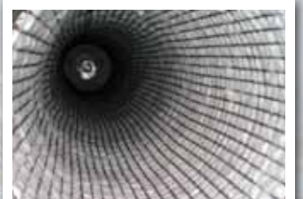
HIGH EFFICIENCY PLUS – HE+