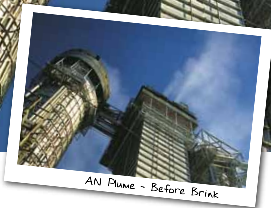
AN Plume - Before Brink