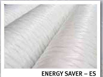
ENERGY SAVER – ES