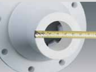
REVERSE JET NOZZLE